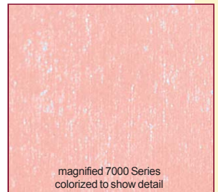
magnified 7000 Series colorized to show detail

OmniRoll™ - 7000 Series - The OmniRoll has the same raw materials and manufacturing process as our Standard 4000 Series material, but has a lighter basis weight. This material composition has excellent air flow characteristics, which allows the printer's vacuum system to work as designed, but also makes it an ideal roll for printers that have not been upgraded with a vacuum assisted wiper system. Because of its lighter basis weight, it accommodates additional linear feet per roll while maintaining the standard roll OD specification. Rolls made from the OmniRoll material begin with "7", i.e., part number 7101MP represents an MPM roll made with the 7000 Series material, while part number 7101MP-55 has 55 linear feet of material instead of the normal 39 feet for a standard MPM roll.