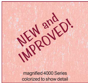
magnified 4000 Series colorized to show detail

Standard - 4000 Series - JNJ's Standard SmartRoll material is the industry standard for cleaning the underside of stencils, keeping them free from solder paste, flux, inks, and epoxies between prints. Our new and improved DuPont Sontara® material enhances air flow, now allowing complete compatibility of any stencil printer with or without vacuum. Wiping with SmartRolls prevents smearing, bridging, solder balls, and other problems associated with stencil printing. This cleanroom grade wiping roll is very low in surface lint, is tough, absorbent, resists tearing and shredding, and can be used with or without solvent. Rolls made from the Standard material begin with "4", i.e. part number 4101MP represents an MPM roll made with the 4000 Series material.