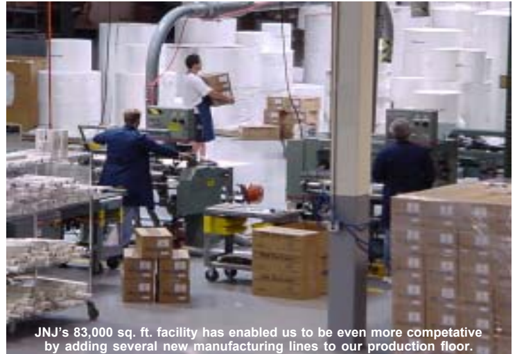
JNJ's 83,000 sq. ft. facility has enabled us to be even more competitive by adding several new manufacturing lines to our production floor.

JNJ offers many cost saving services. We have dedicated equipment that allows us to be an exclusive manufacturer providing custom solutions to your companies specific development and production requirements. Because we're the actual manufacturer, we can produce a custom roll based on your specifications. While most roll suppliers either shy away from or lack the capabilities to provide this service, JNJ finds it easy! JNJ has assisted many companies such as Soletron, Celestica, Nokia, SCI, Sanmina, Flextronics and Motorola in customizing rolls for their specific applications.