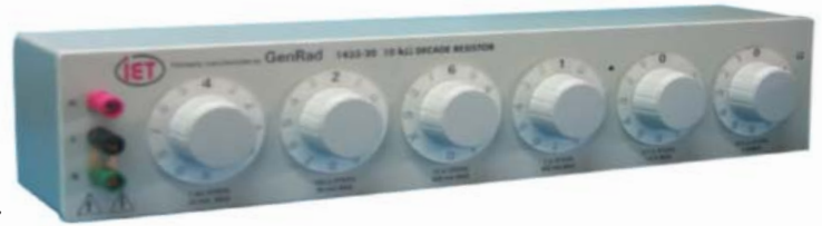
Model 1433 Precision Decade Resistor

The 1433 Decade Resistors are primarily intended for precision measurement applications where their excellent accuracy, stability, and low zero resistance are important. They are convenient resistance standards for checking the accuracy of resistance measuring devices and are used as components in dc and audio frequency impedance bridges. Many of the models can be used into the radio-frequency range.